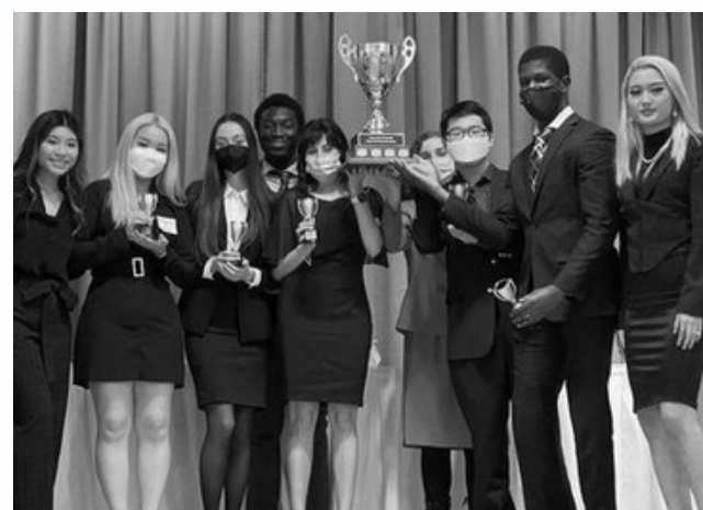
University of Toronto Mock Trial Cup, 2021