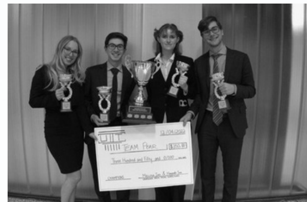
Winners of the University of Toronto Mock Trial Cup, 2022 U of T American Mock Trial Captains and Directors 2022-2023