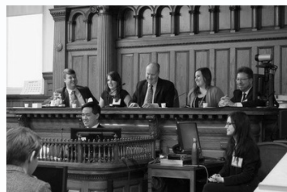
University of Toronto Moot Cup, 2016